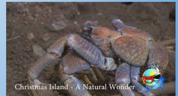
Christmas Island - A Natural Wonder